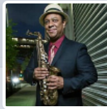
Vincent Herring saxophone