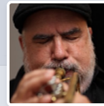
Randy Brecker trumpet